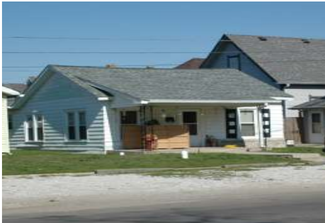
1632 E. Orange St.