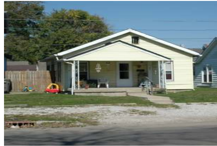
1628 E. Orange St.