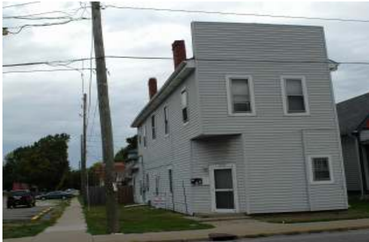
Quad 1238 State St.